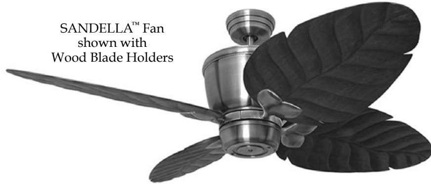
SANDELLA™ Fan shown with Wood Blade Holders