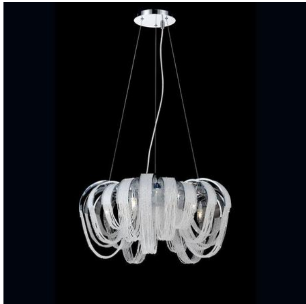
Draped rings of crystal beading layered in curved polished chrome tracks