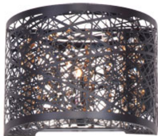
E21302-10BZ Inca 1-Light Wall Sconce