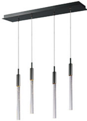
E32774-91BC Scepter 4-Light Pendant