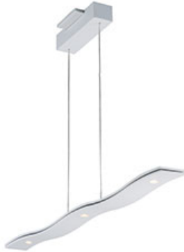
E22822-MW Roller LED 5-Light Pendant