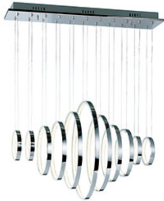
E22716-PC Hoops LED Pendant