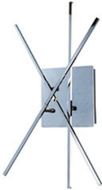
E20691-PC Kriss Kross LED Wall Sconce