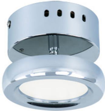
E21140-01PC Timbale 1-Light LED Ceiling/Wall