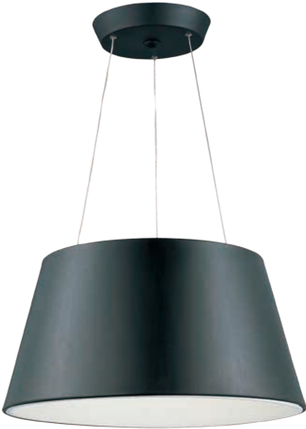
E20908-BK Pendant A