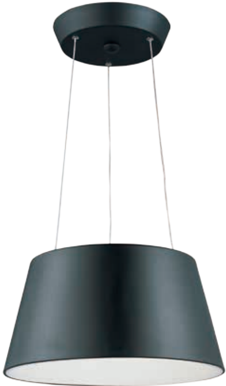
E20906-BK Pendant B