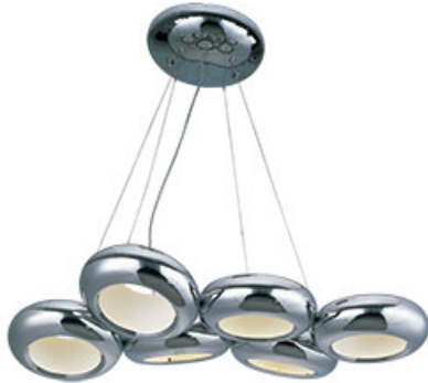
E22596-PC Donuts 6-Light LED Pendant