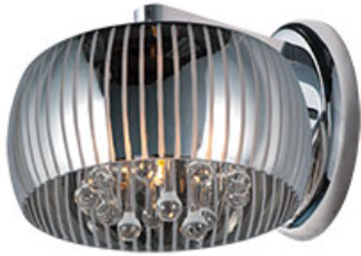
E21409-81PC Sense II 1-Light Wall Sconce