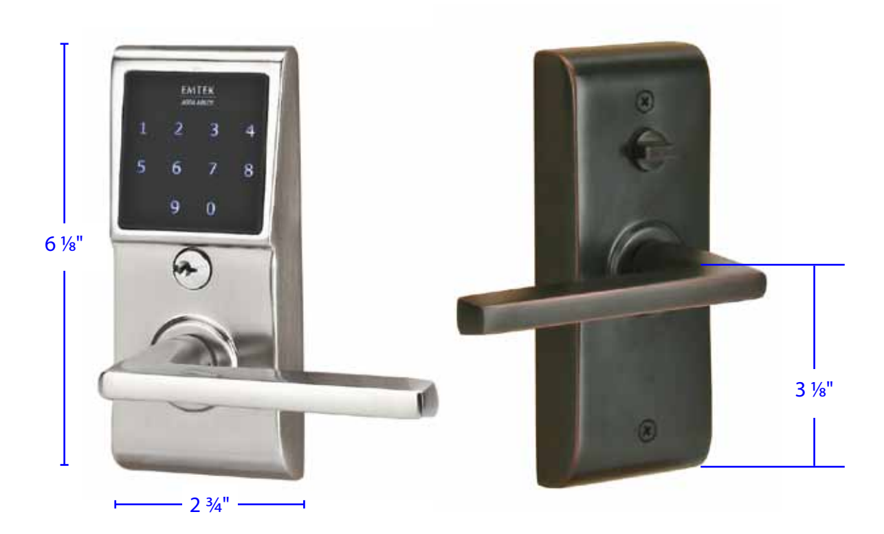
Exterior Projection: 3"