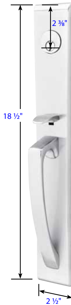
Orion Trim Style Part # 4816