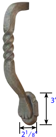
San Carlos Grip Part # 3312