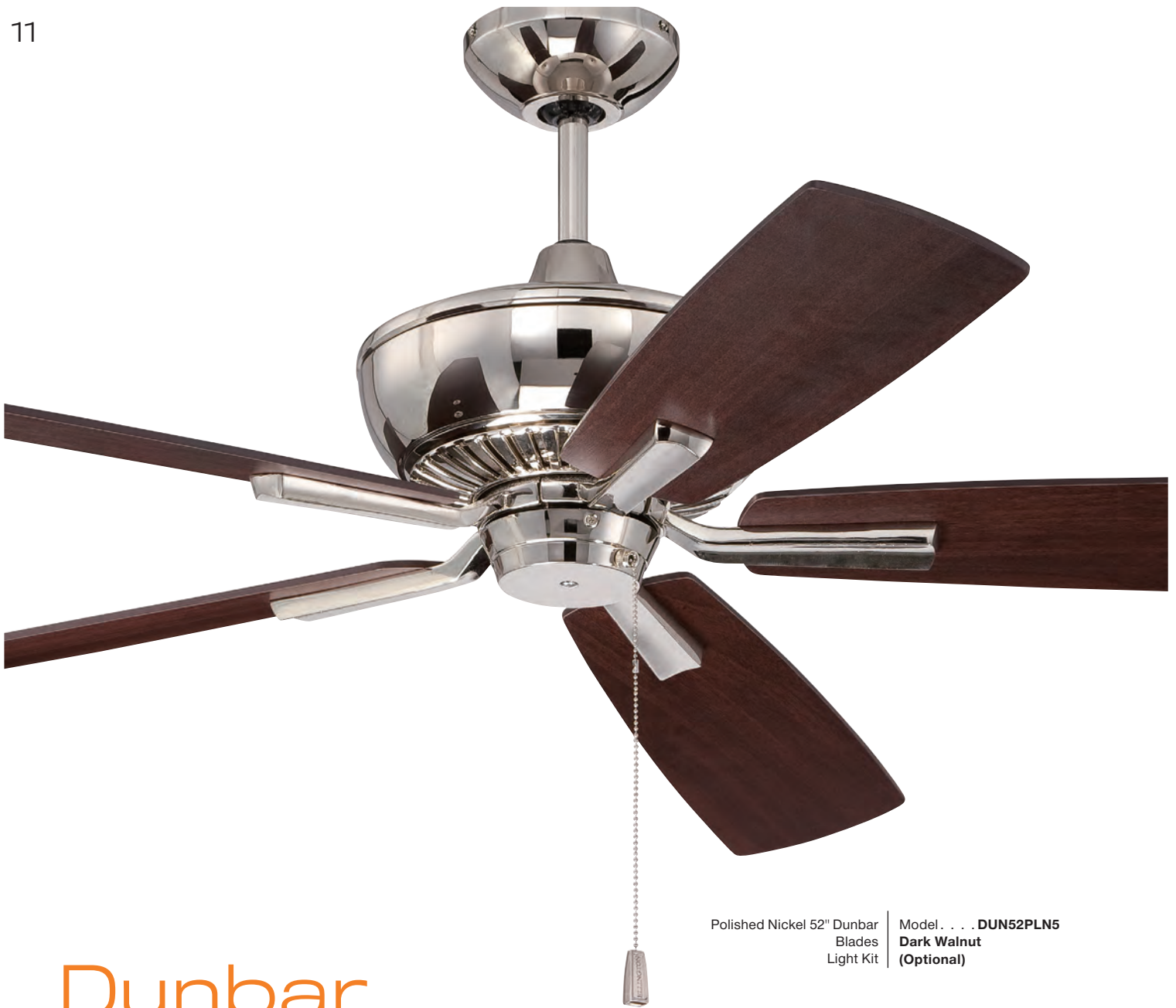
Polished Nickel 52" Dunbar Blades Light Kit | Model . . . DUN52PLN5 Dark Walnut (Optional)