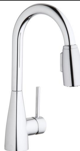
Lustrous Steel (LS)