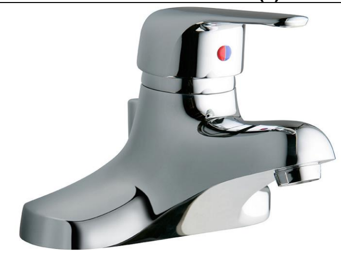
AMERICAN PRIDE. A LIFETIME TRADITION. Like your family, the Elkay family has values and traditions that endure. For almost a century, Elkay has been a family-owned and operated company, providing thousands of jobs that support our families and communities.