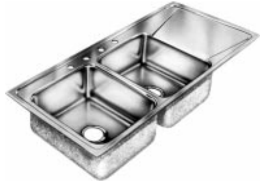
Model ILR-4822-L-4 Shown

Rinsing Basket: LKRB-1611 and LKERB-SS. Bottom Grid: LKBG-1613. Cutting Board: CB-1713 and CBT-1713. These sinks comply with ANSI Standard A112.19.3m.