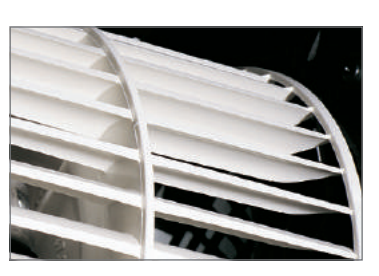
DUAL-CENTRIFUGAL FANS Move air quietly and quickly - up to 600 cu. ft. of air per minute.

LCD ELECTRONIC CONTROLS An array of versatile options with easy-toread blue displays, including a convenient kitchen timer and fan-speed selection. The hood also features sensors that will turn the unit on automatically if it senses heat or smoke.