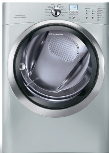
Silver Sands EIFLS60L SS