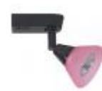
All Black w/Pink Glass