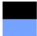
All Black w/Blue Glass