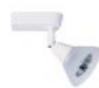
All White w/White Glass