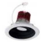
Black w/White ring