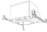
6" ICA Housing New Construction