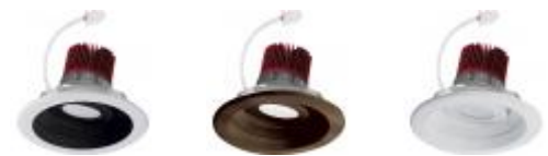
Black w/White ring