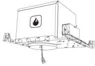
2-Hour Fire Rated 6" ICA Housing New Construction