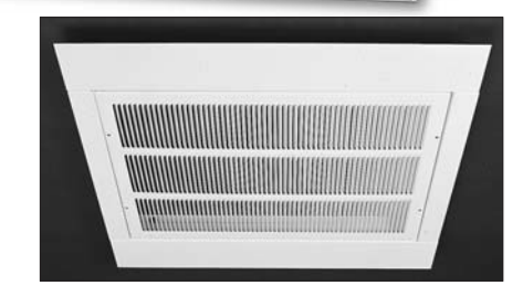
RFITF T-bar Ceiling Mount Trim (white only)

• Vestibules, entrance ways, stairwells, kiosks