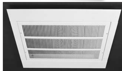
RFITF T-bar Ceiling Mount Trim (white only)