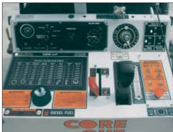
CC7200 Control Panel