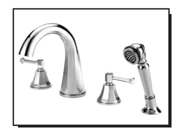
D314768 (shown) BRANDYWOOD™

Danze products are covered by a manufacturer's limited "lifetime" warranty for manufacturing defects.