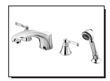
D301725 (Shown) AERIAL™

Danze faucets are covered by a manufacturer's limited "lifetime" warranty for manufacturing defects.