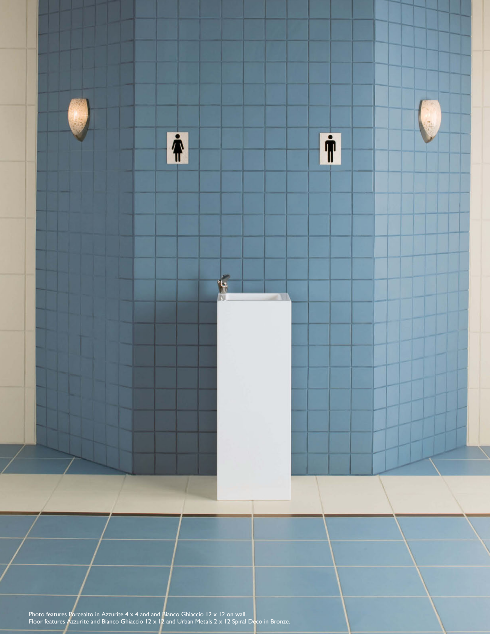
Photo features Porcelato in Azzurite 4 x 4 and Bianco Ghiaccio 12 x 12 on wall. Floor features Azzurite and Bianco Ghiaccio 12 x 12 and Urban Metals 2 x 12 Spiral Deco in Bronze.