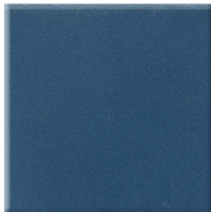
GALAXY CD48 (4)