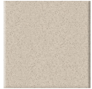
BIANCO ALPI CD05* (1)