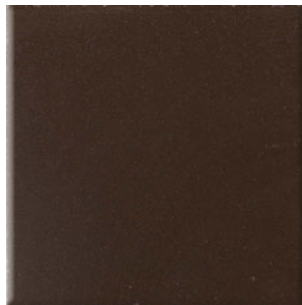
CITYLINE KOHL CD21 (3)