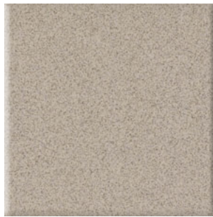
PEPE GRIGIO CD41* (1)