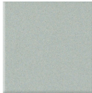
VERDE LAGO CD46 SP(1)