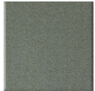
VERDE ALGHERO CD07 (1)