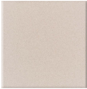
DUNA DI SABBIA CD98 (1)