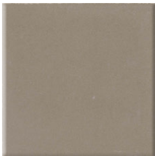
UPTOWN TAUPE CD02 (2)