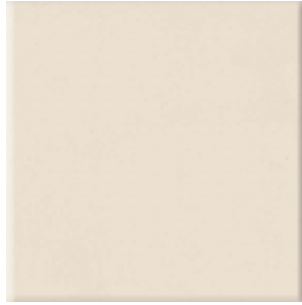
BIANCO GHIACCIO CD28 (2)