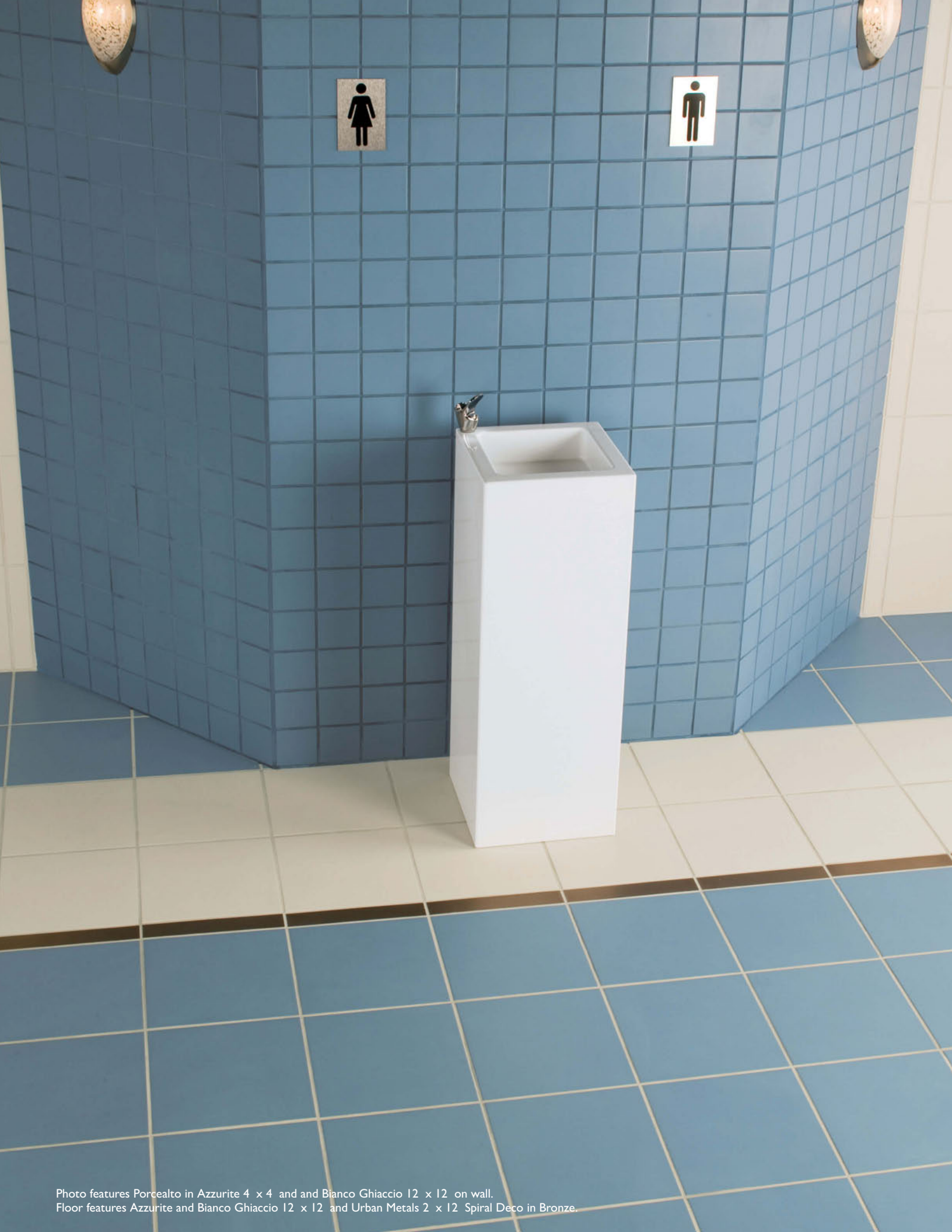
Photo features Porcelto in Azzurite 4 x 4 and Bianco Ghiaccio 12 x 12 on wall. Floor features Azzurite and Bianco Ghiaccio 12 x 12 and Urban Metals 2 x 12 Spiral Deco in Bronze.