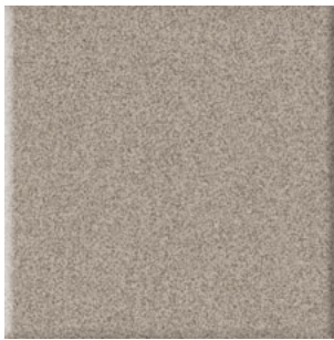
MANDORLA CON SPEZIA CD78 (1)