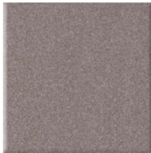
GRIGIO SCURO CD42* (1)