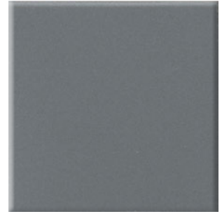
SUEDE GRAY CD19 (2)