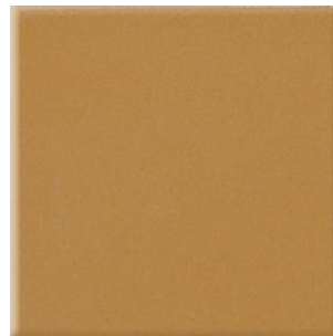
GOLD COAST CD03 (2)