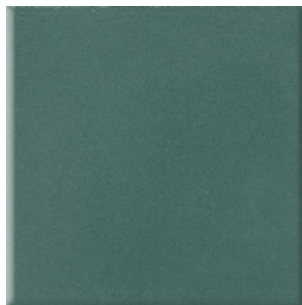
AEGEAN CD47 (4)