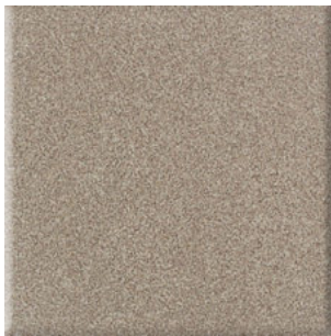
MARRONE CANNELLA CD77 (1)