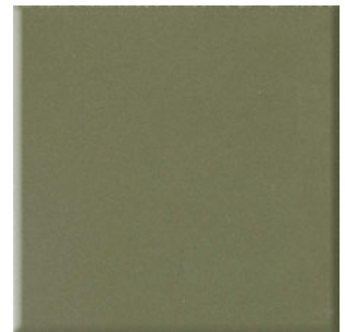
GARDEN SPOT CD25 (3)