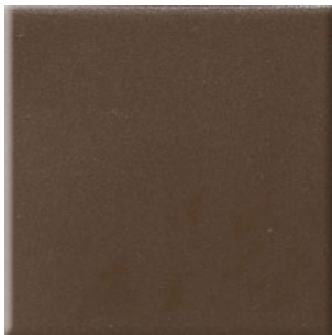
ARTISAN BROWN CD20 (3)