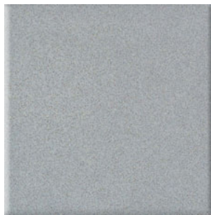
CADET GRAY CD38 (1)