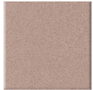
ROSA ANTICO CD56 (1)