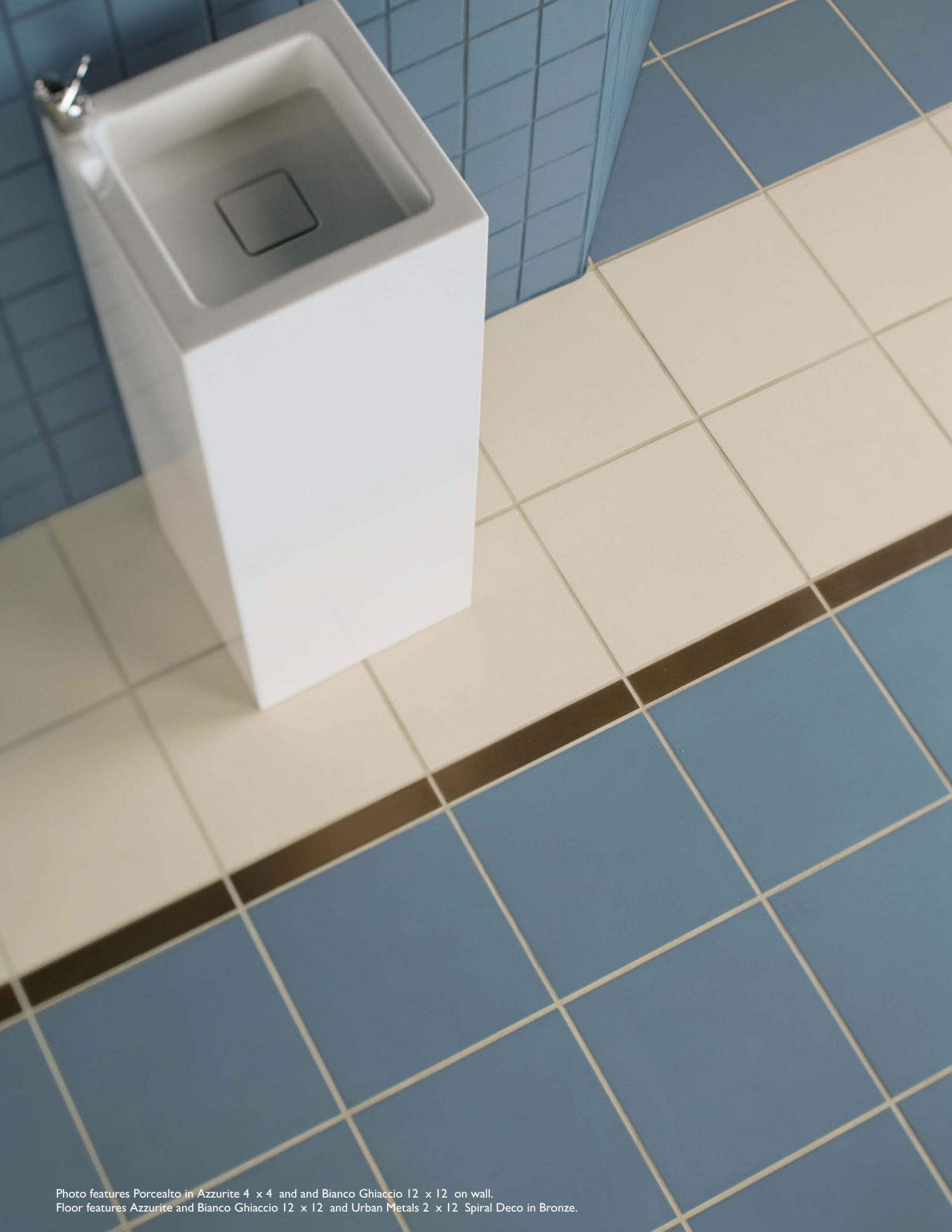
Photo features Porcelto in Azzurite 4 x 4 and Bianco Ghiaccio 12 x 12 on wall. Floor features Azzurite and Bianco Ghiaccio 12 x 12 and Urban Metals 2 x 12 Spiral Deco in Bronze.