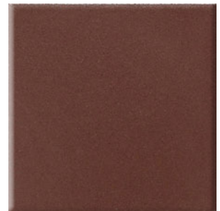
CINNAMON RANGE CD24 (3)