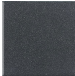
NERO MACCHIATO CD37 (1)

*A grid (skid-resistant) surface finish is available via special order in 8 x 8 only in select colors. (1), (2), (3) and (4) indicate Price Group, (1) being the least expensive. See chart for size and surface availability.