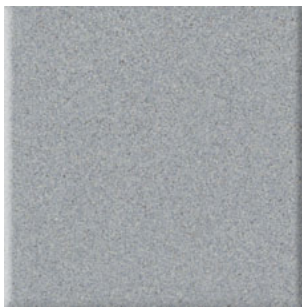
LABRADORITE CD49 (1)