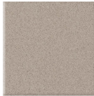
GRIGIO GRANITE CD40 (1)