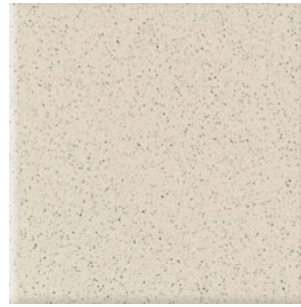
FUORI DI BIANCO CD39 (1)