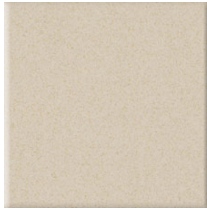
BEIGE CD31* (1)