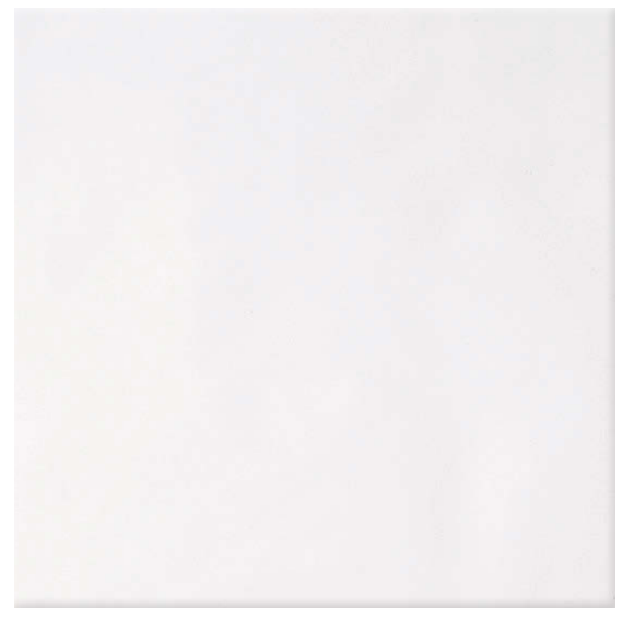
GLOSS WHITE PL02