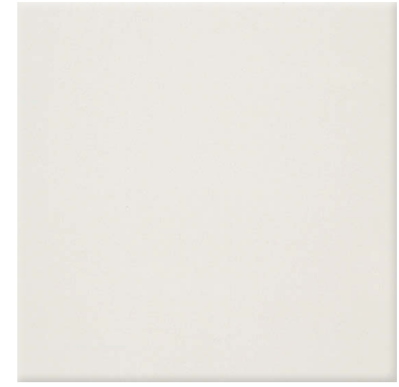
GLOSS ALMOND PL22