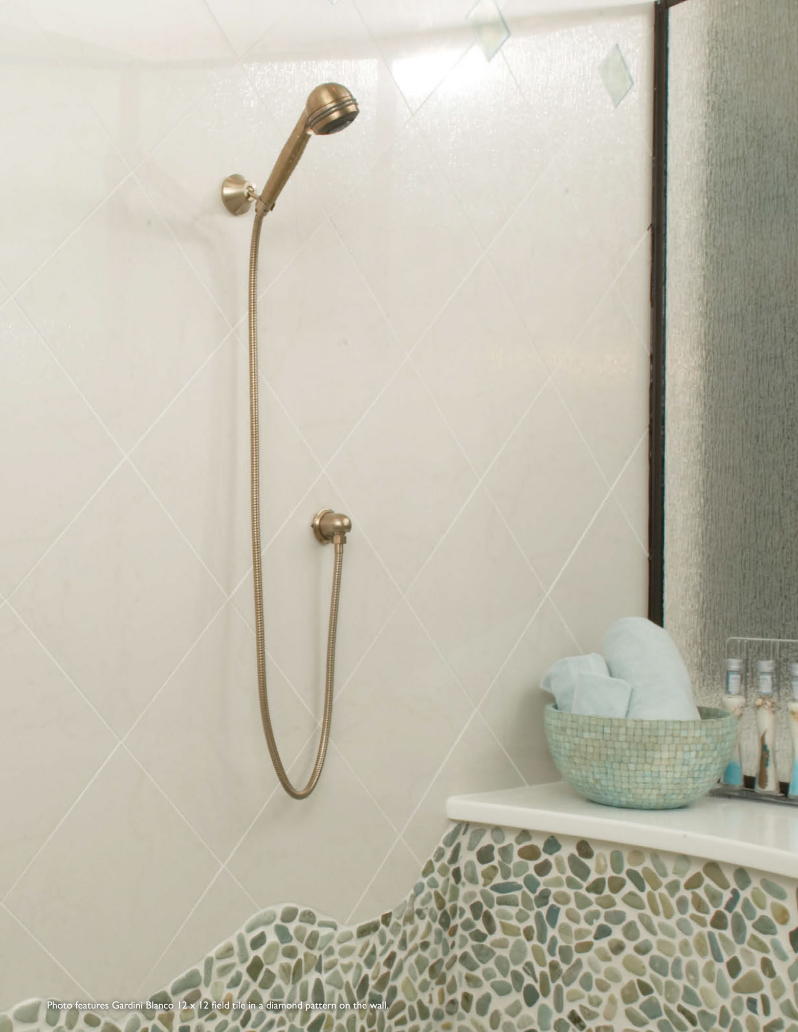
Photo features Gardini Blanco 12 x 12 field tile in a diamond pattern on the wall.