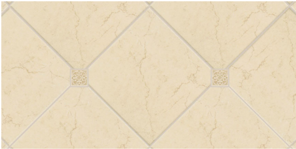
Backsplash features Adriana Creme 12 x 12 field tile with Fashion Accents 2 x 2 Petifour accent in Almond.