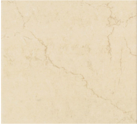
ADRIANA CREME CE10