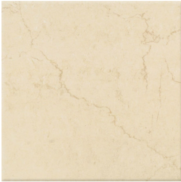
ADRIANA CREME CE10