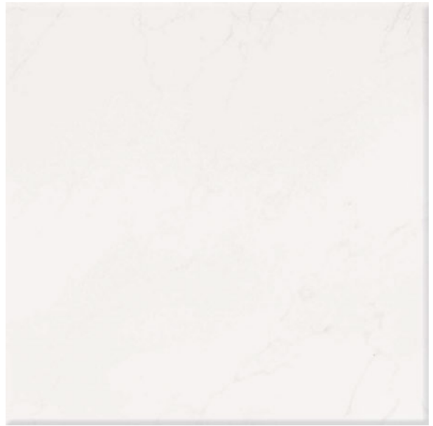
GARDINI BLANCO CE11