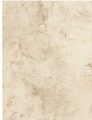
WINDRIFT BEIGE BC02