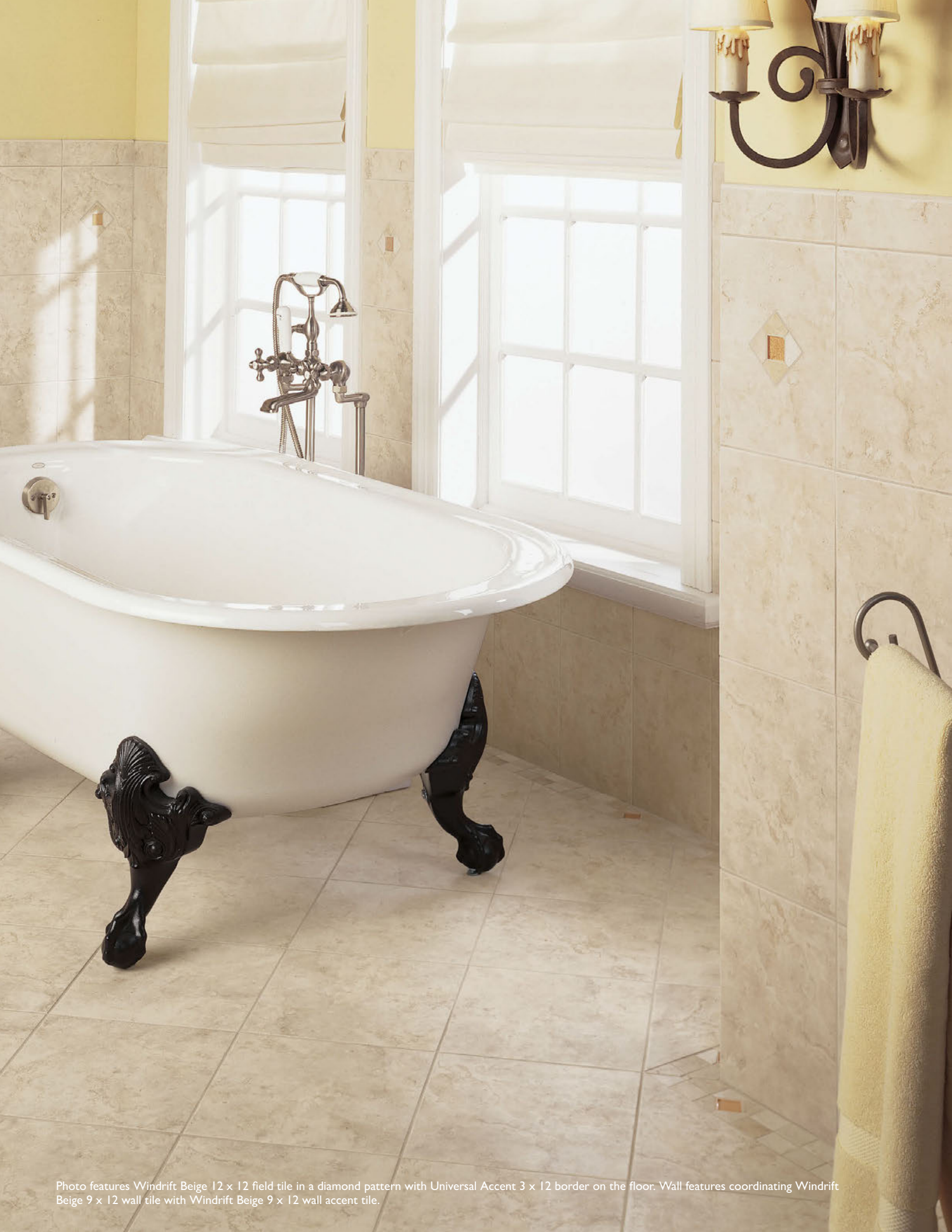
Photo features Windrift Beige 12 x 12 field tile in a diamond pattern with Universal Accent 3 x 12 border on the floor. Wall features coordinating Windrift Beige 9 x 12 wall tile with Windrift Beige 9 x 12 wall accent tile.