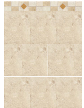
BRICK-JOINT PATTERN WITH ACCENT