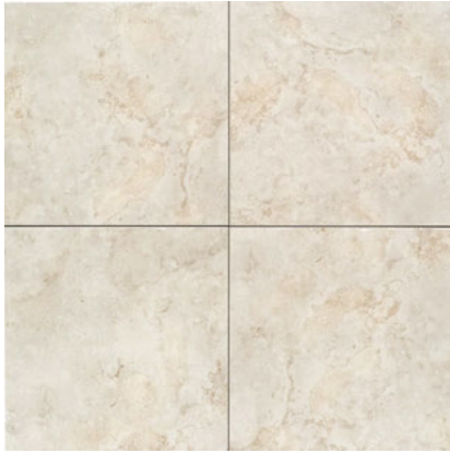
ARIA IVORY BC01