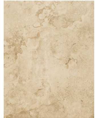
FRESCO CAFFE BC03