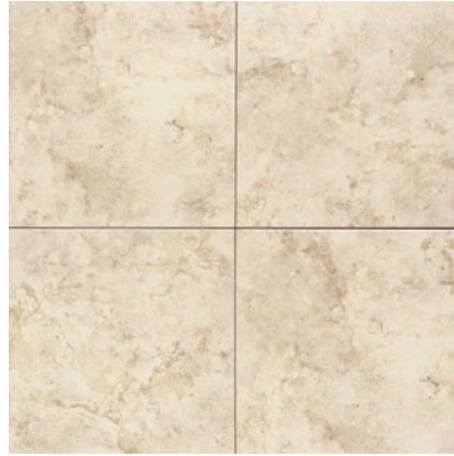
WINDRIFT BEIGE BC02