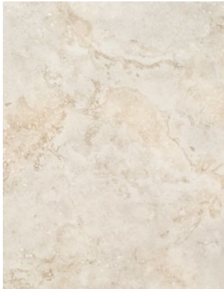
ARIA IVORY BC01