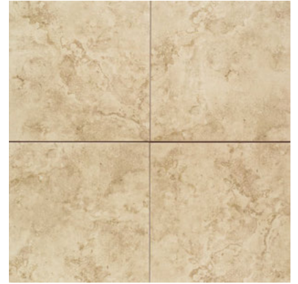
FRESCO CAFFE BC03