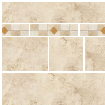
BRICK PATTERN WITH BORDER