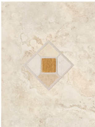
ARIA IVORY BC01