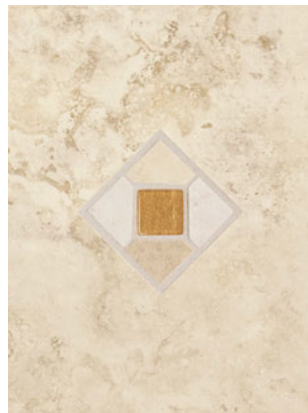
WINDRIFT BEIGE BC02