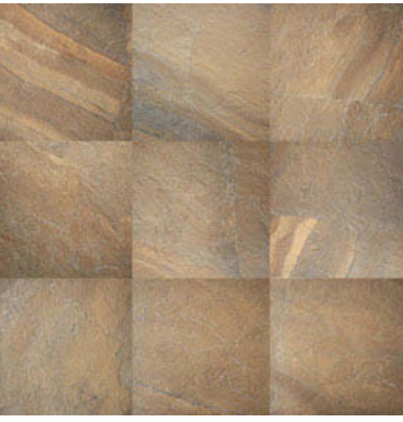
BRONZED BEACON AY03