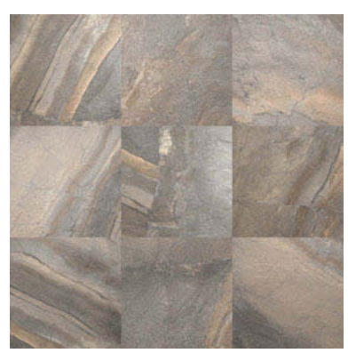
MAJESTIC MOUND AY04