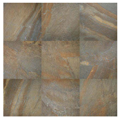
RUSTIC REMNANT AY05