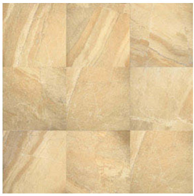
GOLDEN GROUND AY02