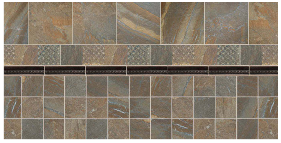
Backsplash features Ayers Rock in Rustic Remnant 6-1/2 \times 6-1/2 field tile, 3 \times 3 mosaic, and 3 \times 13 decorative accent, with Ion Metals 1-1/2 \ge 6 chair rail in Antique Bronze.