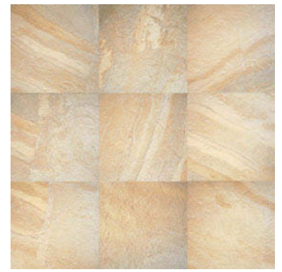
SOLAR SUMMIT AYOI