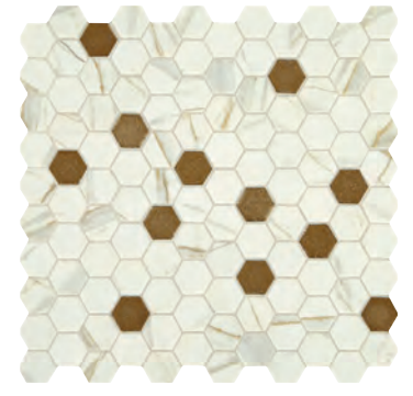
POSH CHIFFON UP27