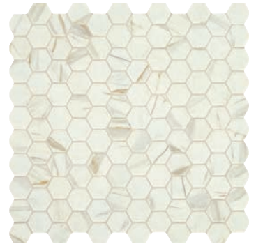
POSH SPRITZER UP24*