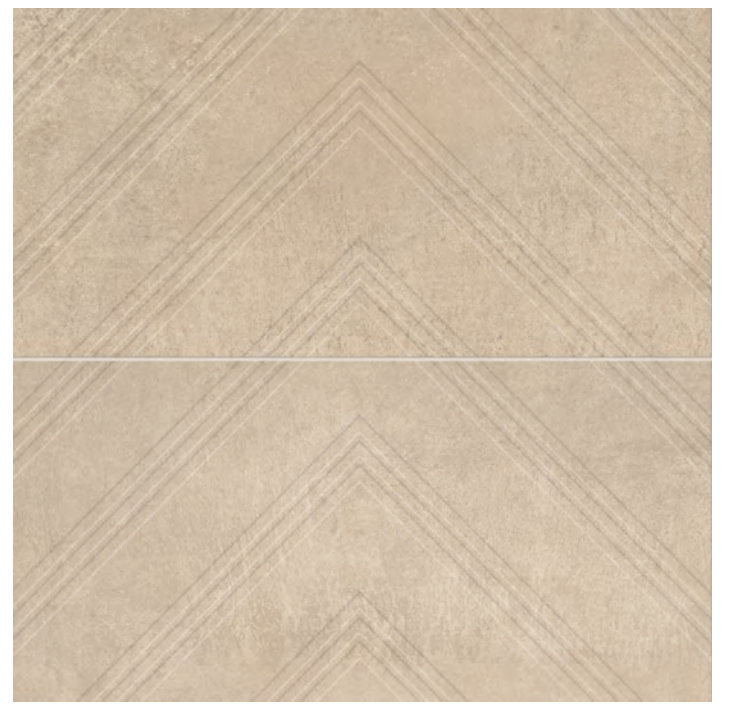
OPTION 1: CHEVRON PATTERN