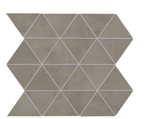
FORTE GREY CH25