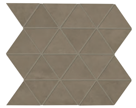
RHYTHM BROWN CH23