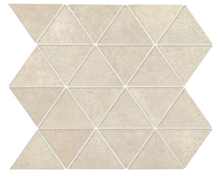
SONATA WHITE CH20