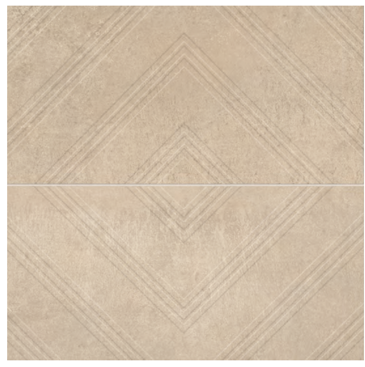
OPTION 2: DIAMOND PATTERN