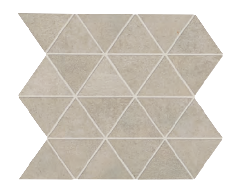
CANON GREY CH22