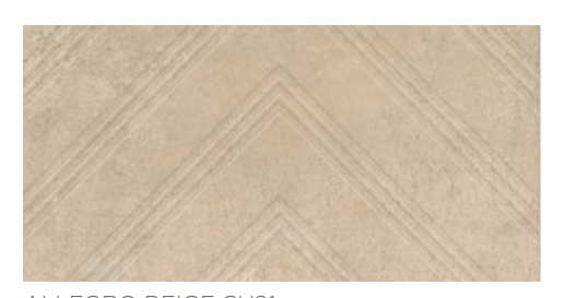
ALLEGRO BEIGE CH21