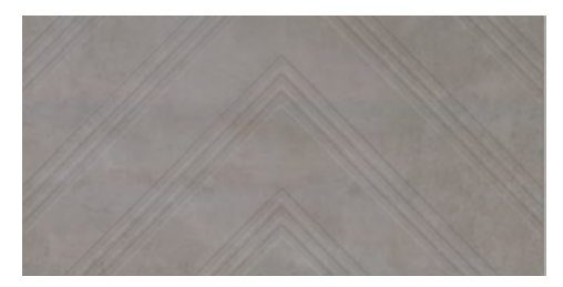
FORTE GREY CH25