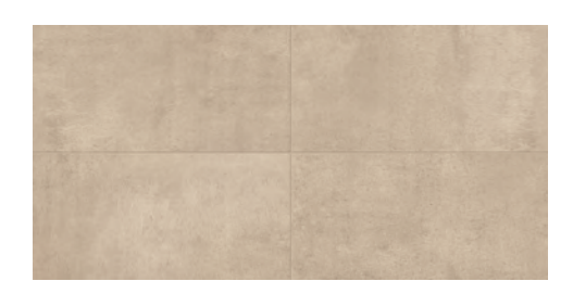
ALLEGRO BEIGE CH21