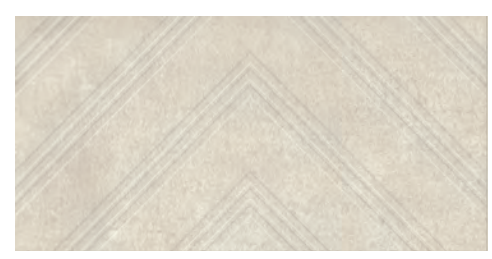
SONATA WHITE CH20