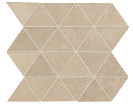
ALLEGRO BEIGE CH21