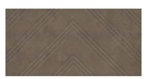
BARITONE BROWN CH24