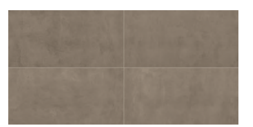
RHYTHM BROWN CH23