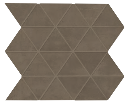
BARITONE BROWN CH24