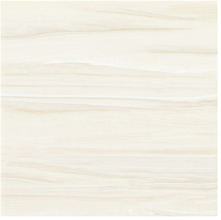
VISIONARY GLOSS CP05