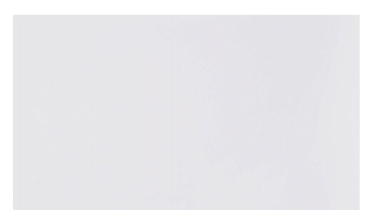
GESSO GLOSS CP01 / GESSO MATTE CP02