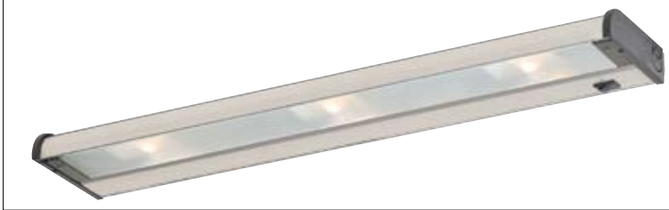
3 Lamp 24" (24"L x 5"W x 1½"H)