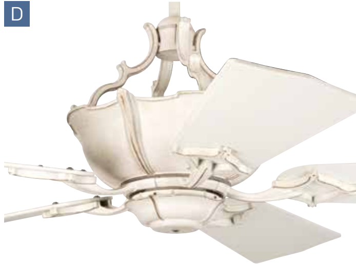
A French White Wellington XL Model . . . WXL52FW Blade . . . B554PR-OAK- Premier Rustic Oak Light . . . WXLK-FW-LED, Shown, Sold Separately