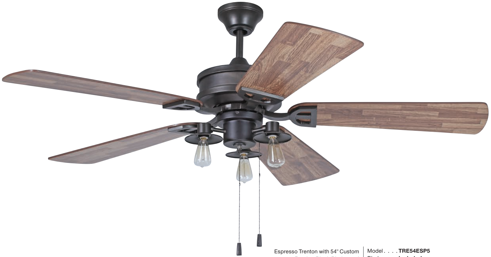
Espresso Trenton with 54" Custom Butcher Block Blades and Integrated Light Kit | Model . . . . TRE54ESP5 Blade . . . . Included Light . . . . Integrated