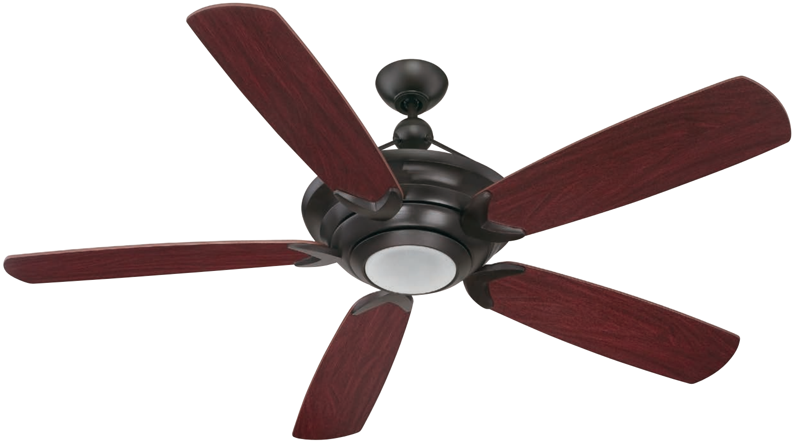
Oiled Bronze Vesta with Reversible 60" Custom Oiled Bronze/Mahogany (Shown) Blades and Integrated Light Kit | Model . . . VS60OB5 Blade . . . Included Light . . . Integrated