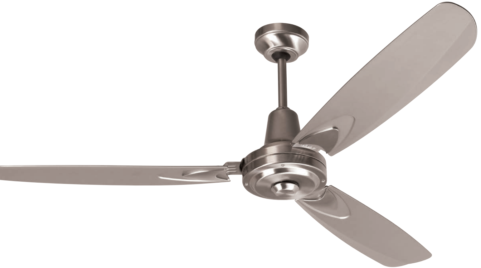
Stainless Steel Velocity with 58" Custom Velocity Brushed Nickel Blades | Model . . . . VE58SS3 Blade . . . . Included Light . . . . Not Adaptable