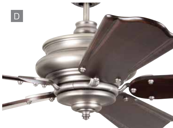
A Oiled Bronze Townsend Model . . . TS52OB e. . . . . B554P-WAL-Premier Hand-Scraped Walnut Light . . . . Adaptable (Optional)