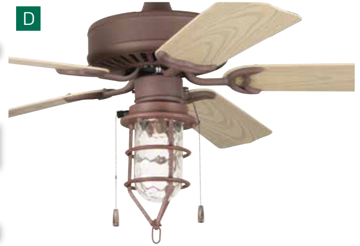
A Galvanized Porch Fan Model . . . . . PF52GV Blade . . . . . B552S-OWP-Outdoor Standard Weathered Pine Light. . . . . OLK3CFL-GV, Shown, Sold Separately Location . . . . Suitable for Damp Locations