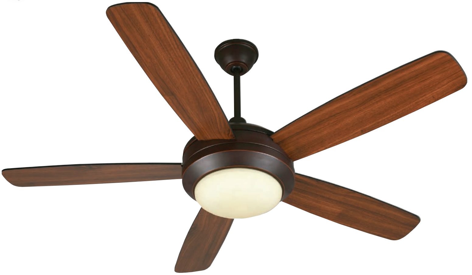
Oiled Bronze Gilded Helios with 52" Reversible Walnut (Shown)/Oiled Bronze Blades and Integrated Amber Frost Glass Light Kit Model . . . HE52OBG5 Blade . . . Included Light . . . Integrated