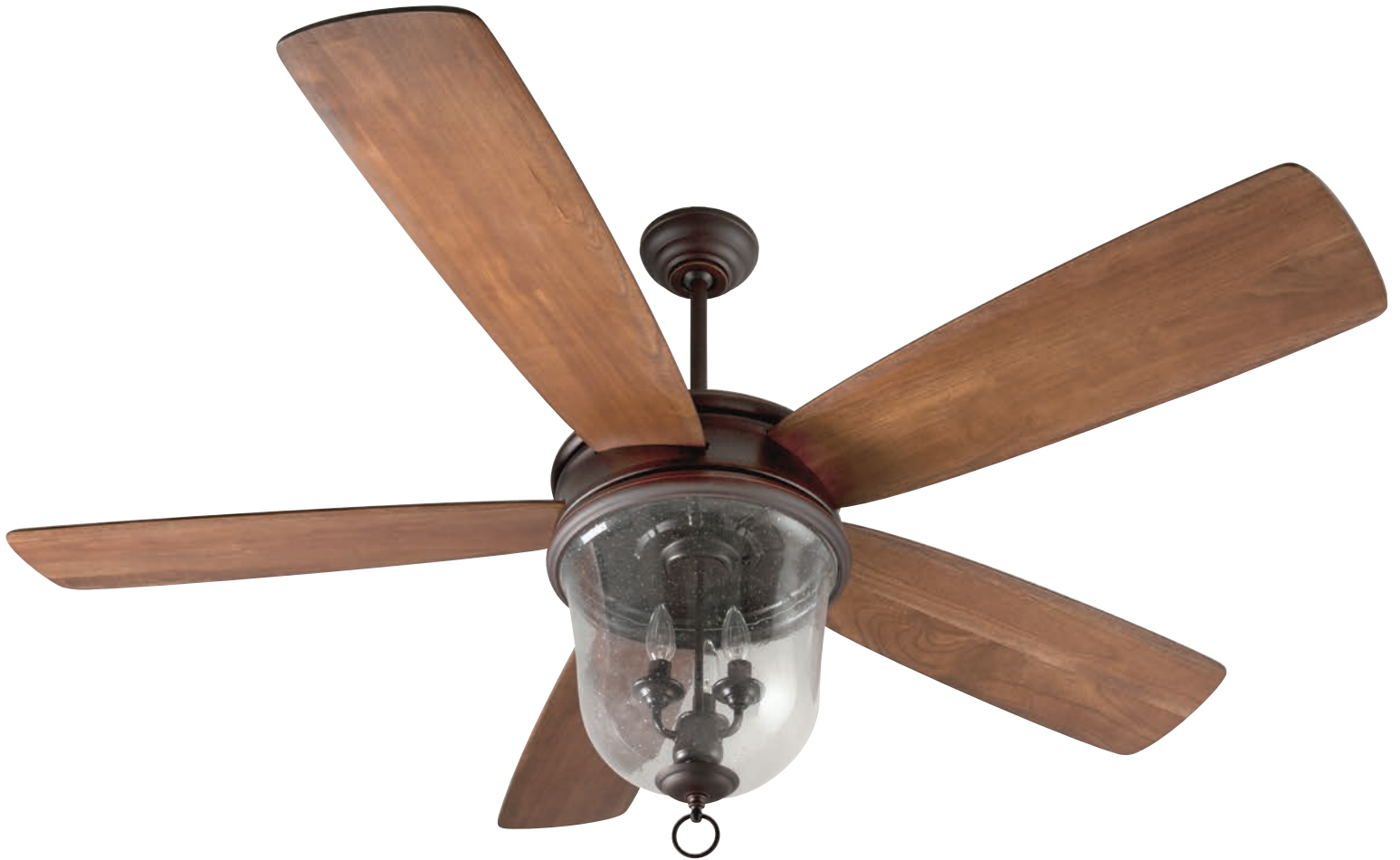
Oiled Bronze Gilded Fredericksburg with 60" Fredericksburg Walnut Blades and Integrated Clear Seeded Glass Light Kit Model . . . FB60OBG5 Blade . . . Included Light . . . Integrated