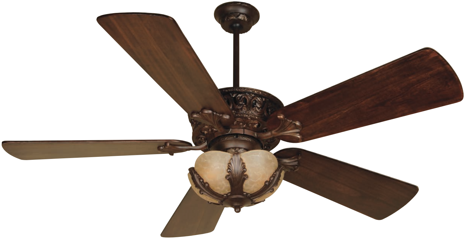
Aged Bronze Textured Fiori with 54" Premier Distressed Walnut Blades and Bowl Light Kit | Model . . . FI52AG Blade . . . B554PD-WAL Light . . . LKE305CFL-AG