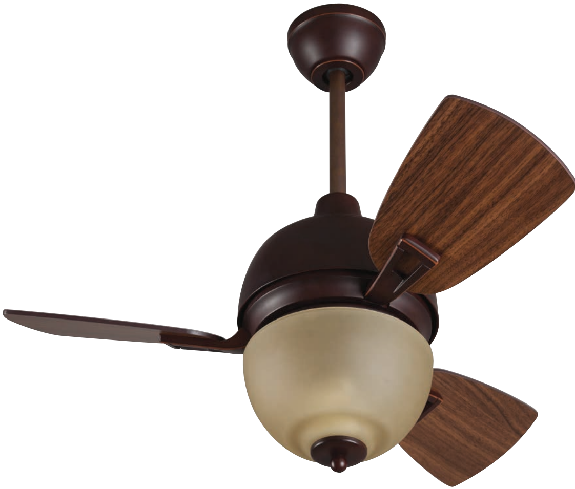
Oiled Bronze Gilded Dane with 30" Custom Walnut Blades and Bowl Light Kit | Model . . . DA30OBG3 Blade . . . Included Light . . . Included