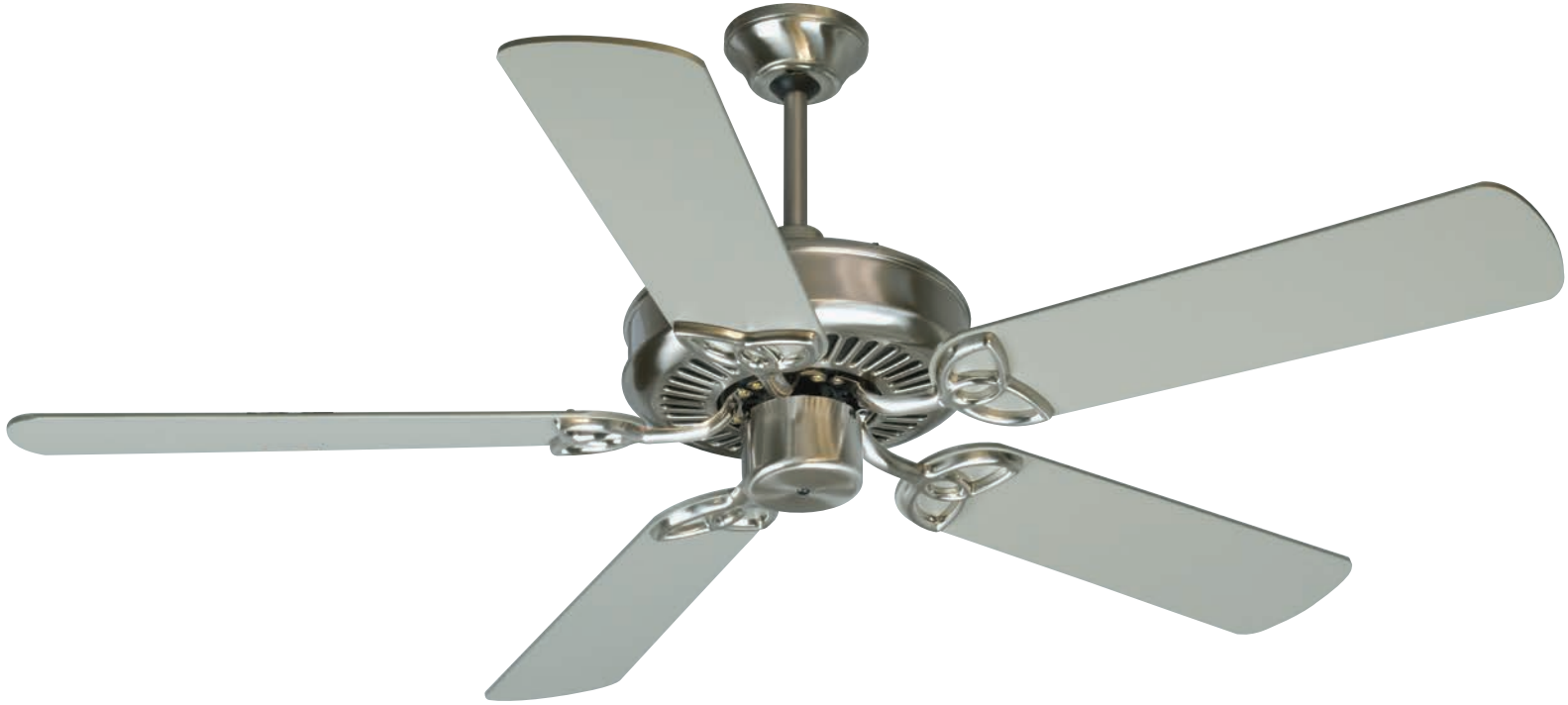
Stainless Steel CXL with 52" Plus Series Brushed Nickel Blades | Model . . . CXL52SS Blade . . . . B552P-BN Light . . . . Not Shown