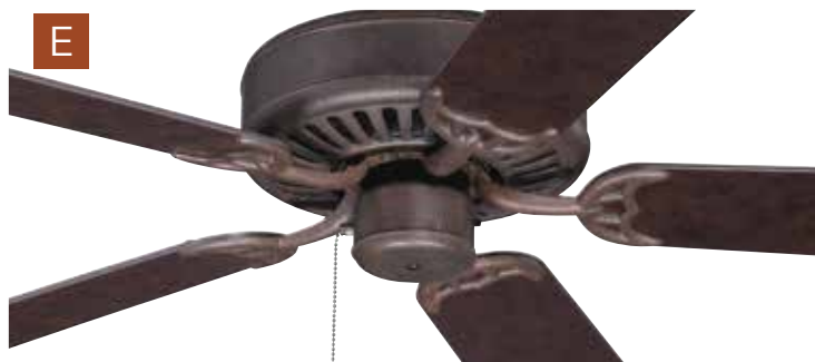
A Aged Bronze Brushed Pro Builder Model . . . . . C52ABZ Blade . . . . . BCD52-MA Mahogany, Contractor Light . . . . . Adaptable, Optional