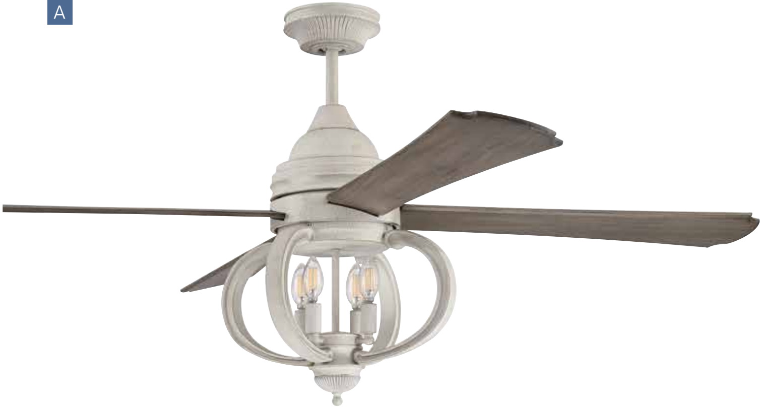
A Cottage White 60" Augusta Model . . . AUG60CW4 Blade . . . Driftwood Light . . . Integrated